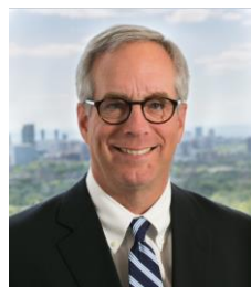
Ontario, Canada Age: 65

Lead Independent Trustee since: July 22, 2015